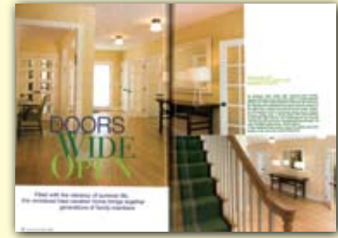
Design NJ, Aug/Sept 2006