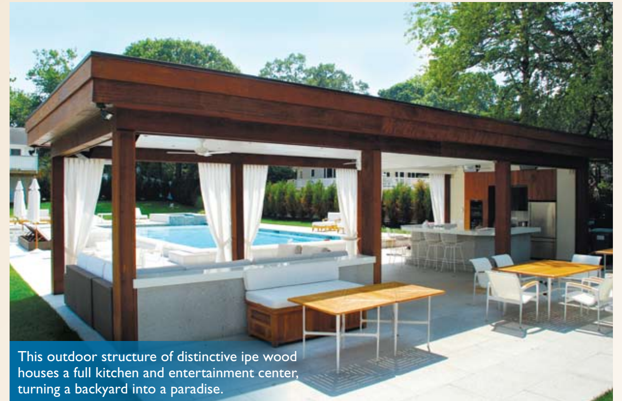
This outdoor structure of distinctive ipe wood houses a full kitchen and entertainment center, turning a backyard into a paradise.