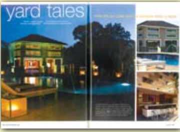
Design NJ, Aug/Sept 2008