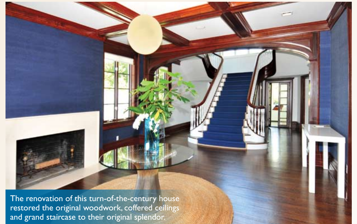
The renovation of this turn-of-the-century house restored the original woodwork, coffered ceilings and grand staircase to their original splendor.

"As we move out tomorrow for the summer to our new home, I wanted to take a moment to sincerely thank both of you for a truly remarkable job. I retain a real sense of gratitude and respect for each of you personally, and for MCB as a group."