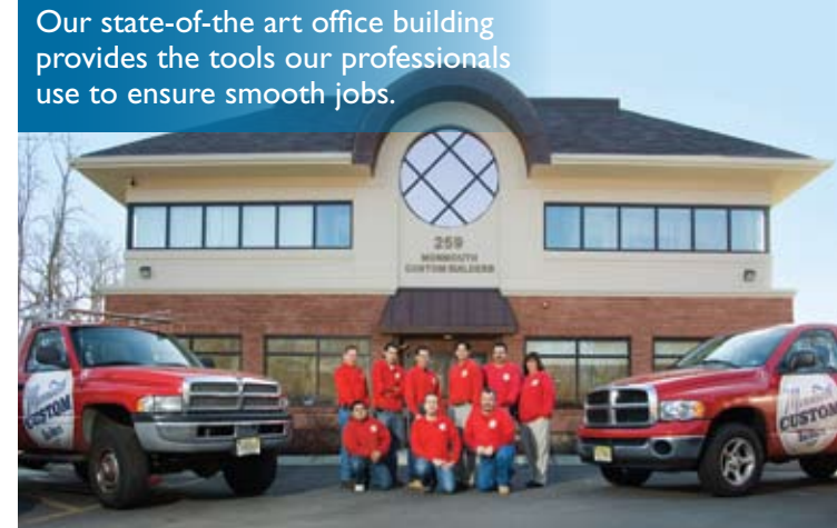
Our state-of-the art office building provides the tools our professionals use to ensure smooth jobs.

OUR CLIENTS TELL US that working with Monmouth Custom Builders is a rewarding and pleasurable experience. From the meticulous notes we take of each meeting, to our commitment to using only the highest-quality materials, our dedication to perfection is apparent on every project. You'll be impressed with the superior craftsmanship of our award-winning work and thrilled with how clean and organized we keep our job sites. We want you to be as absolutely thrilled with working with us as you are with the result.