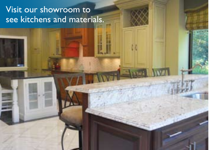
Visit our showroom to see kitchens and materials.

Award-Winning Contractor Monmouth Custom Builder is one of the fastest-growing contractors in the country. Our rapid rise is due to our commitment to excellence which has been recognized by national design awards and leading design publications.