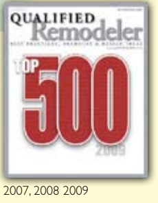
2007, 2008, 2009

Award-Winning Contractor Monmouth Custom Builder is one of the fastest-growing contractors in the country. Our rapid rise is due to our commitment to excellence which has been recognized by national design awards and leading design publications.