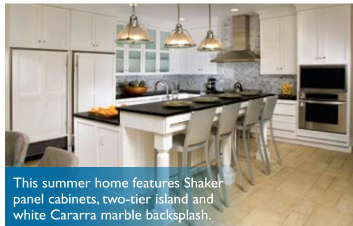
This summer home features Shaker panel cabinets, two-tier island and white Cararra marble backsplash.

Rest assured, that whatever dream you have for your kitchen, our experienced, award-winning team is here to see it through. ■