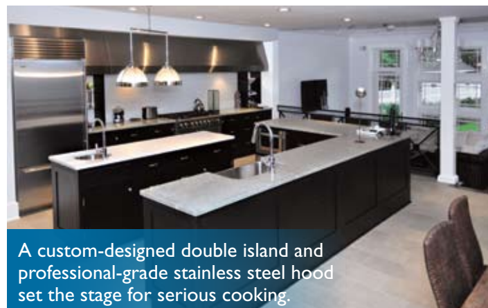
A custom-designed double island and professional-grade stainless steel hood set the stage for serious cooking.